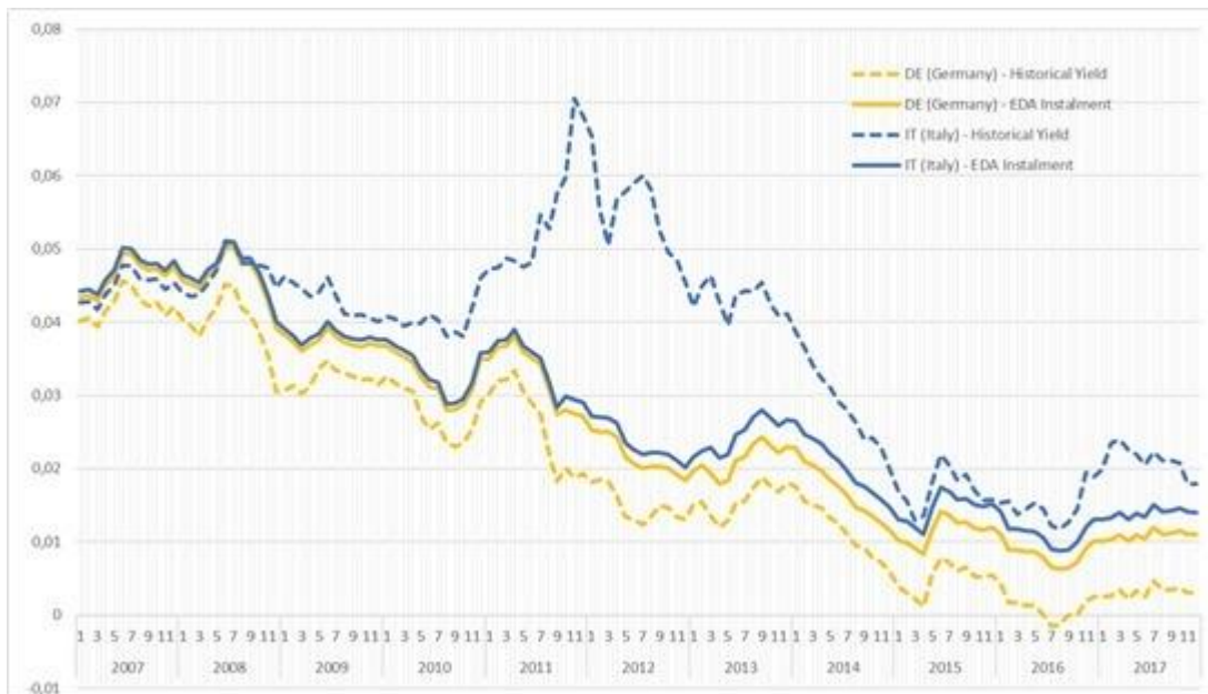
Figure 1. EDA and Spreads: A counterfactual